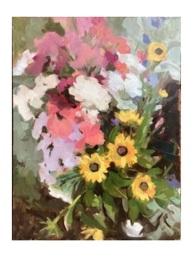
Best Composition Shady Grove Flower Farm By Jessica Green