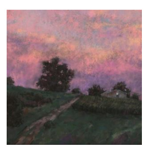
Best Use of Color Gethsemani Farmland By Francis Huffman